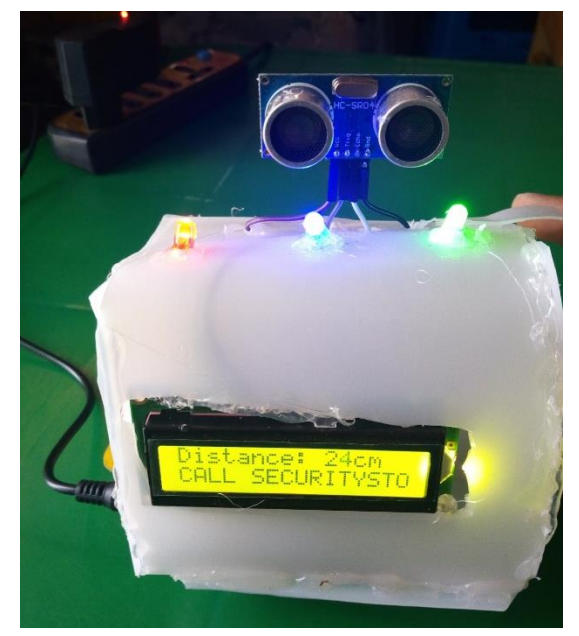
Fig. 7. A motion detector in a container for convenient data collection.

Once confirmed that everything was working as expected, the connections were assembled into a single unit as shown in Figure 8.