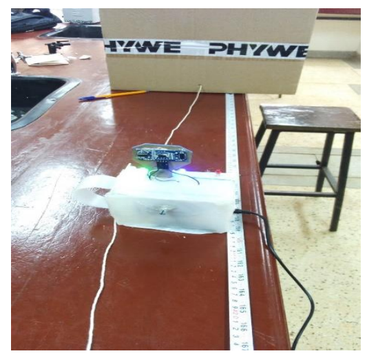
Fig. 8. A motion detector in data collection.

An object was moved along the tape measure as shown on figure 9. The set up in figure 9was set and the carton drawn using the rope. The values from the tape were compared to the corresponding data from the LCD and the readings in the LCD were tabulated in the table 1.