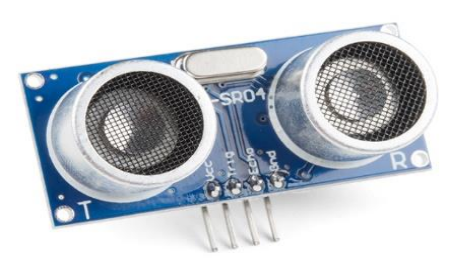
Fig. 1. Ultrasonic sensor for ultrasonic wave production in motion detection.

The HC-SR04 ultrasonic sensor (like the one shown in figure 2) uses SONAR to determine the distance of an object just like the bats do. It offers excellent non-contact range detection with high accuracy and stable readings in an easy-to-use package from 2 cm to 400 cm or 1" to 13 feet. The operation is not affected by sunlight or black material, although acoustically, soft materials like cloth can be difficult to detect. It comes complete with ultrasonic transmitter and receiver module.