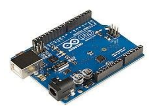
Fig. 1. Figure 1:Arduino Uno microcontroller.

The Arduino Uno is an open-source microcontroller board based on the Microchip ATmega328P microcontroller and developed by Arduino [31,32,33]. The board is equipped with sets of digital and analog