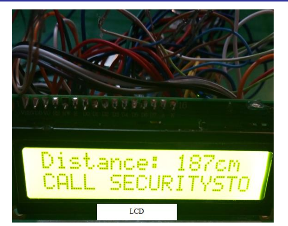
Fig. 6. A motion detector with display of distances on the Liquid Crystal Display.

Once confirmed that everything was working as expected, the connections were assembled into a single unit as shown in Figure 8.