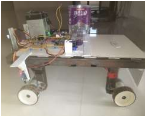
Figure:2 Experimental setup-1