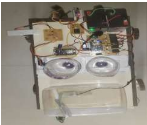
Figure:3 Experimental setup-2