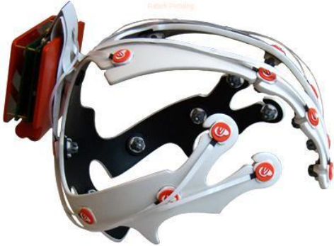
Figure 2: Futuristic headband(old version)

feelings like dissatisfaction. Estimating mental remaining task at hand, dissatisfaction and interruption is normally restricted to subjectively watching PC clients or to regulating overviews after the culmination of an undertaking, conceivably missing significant knowledge into the client's evolving encounters.