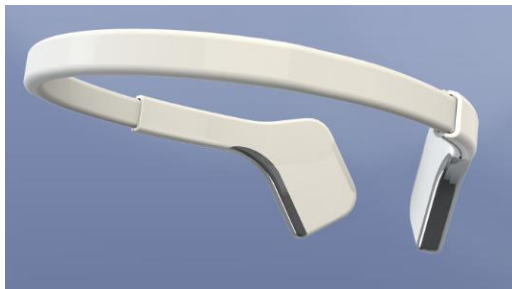
Figure 3: Futuristic headband(new version)