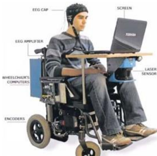
Figure 4: Mind controlled wheel chair

A mind-controlled wheelchair is a mind-machine interfacing device. It uses thought as neural impulses to command the motorized wheelchair's movement. The first device was designed by Diwakar Vaish. The wheelchair is critical to patients suffering from locked-in syndrome. In this condition, the patient cannot move or communicate verbally but aware of everything happening in the surrounding with their eyes open. Such a wheelchair can also be used in case of muscular dystrophy, a disease that weakens the muscular dystrophy, a disease that weakens the musculoskeletal system and hampers locomotion. A mind-controlled wheelchair works using a brain-computer interface. An electroencephalogram is worn by the user. This detects neural impulses that reach the scalp and allows the micro-controller on board to detect the user's thought process, interpret it, and control the wheel chair's locomotion.