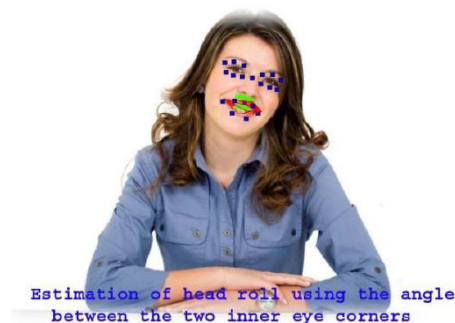
Figure 4: Head pose estimation

center by the center of the image, approximate the focal length by the width of the image in pixels by assuming that radial distortion does not exist.