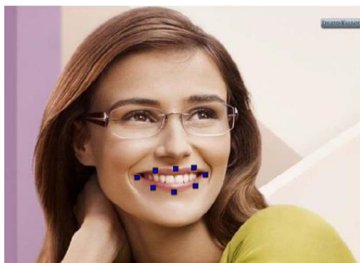
Figure 5: Lip shape tracking

For lip shape tracking that identifies for example lip corner pull for smile and lip pucker the polar distance between each of the two mouth corners and the anchor point is computed. Change from the initial frame is observed and the average percentage change is used to discern mouth displays.