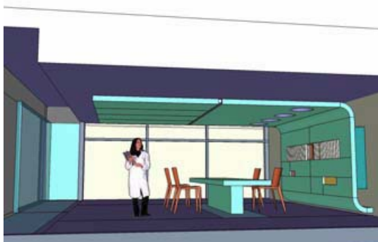
AWE concept – SLEEPING

This dramatic shift in the nature, place and organization of working life results in the designing, prototyping, demonstrating and evaluating of a prototypical "robot-room" with embedded Information Technologies that is called as an "Animated Work Environment" [AWE] (figures 1 and 2).