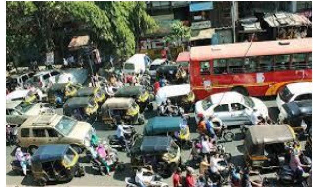
Fig. 1 Traffic Congestion in Roadways

Owing to these congestion problems, people lose time, miss Opportunities, and get frustrated IoT application in traffic management provides dynamic interaction between the components of a transport system, allows inter and intra vehicular communication, smart traffic control, smart parking, electronic toll collection system, logistics and fleet management, vehicle control and safety, road assistance.