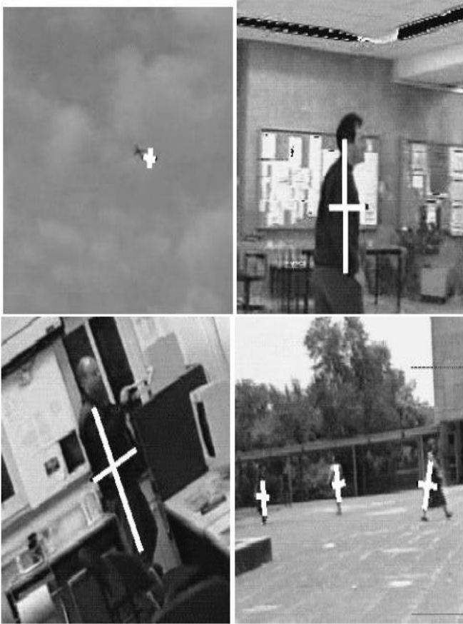
Example of moving Object Detection from a moving Camera

pose, and can also be affected by close by objects. Finally, difficult outdoor environments regularly engage cluttered backgrounds, irregular interaction between traffic participants, and are difficult to control. The subsequent figure illustrate that a person gets detected through a moving camera or it can be detected by using stationary camera.