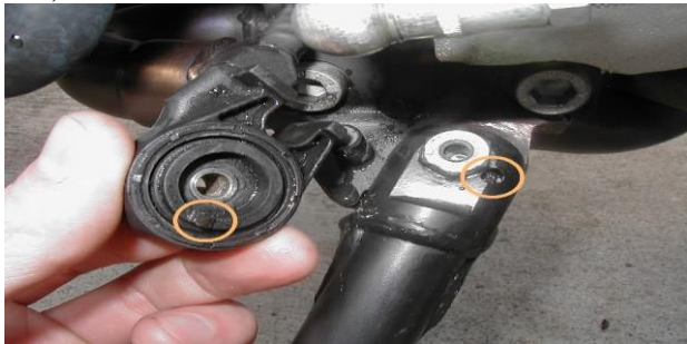
Fig: 2 parts of two wheeler which enables beep sound