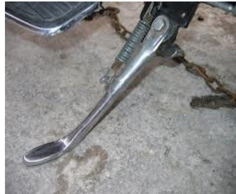
Fig.1 side stand

The side stand is the one of the most nice founded thing of our senior engineer and attached to bike instead of the centre stand most of the times people use only side stand in their bike because it easy to use compare to centre stand.