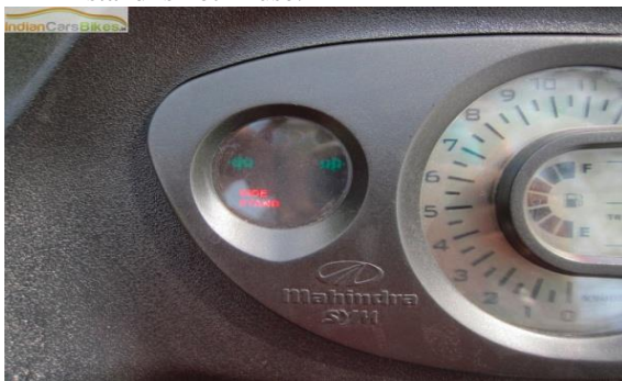
Fig: 3 Bajaj pulsar indicator