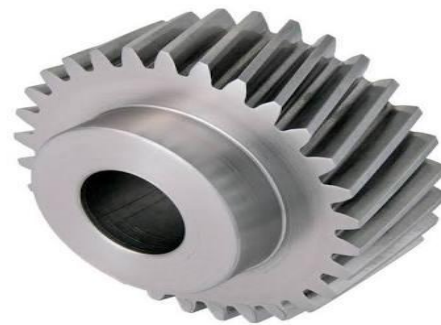
Fig. Helical gear

methods that can easily be put into practice and also give useful. Helical gears are used in fertilizer industries, printing industries and earth moving industries. Helical gears are also used in steel rolling mills, section rolling mills, power and port industries. Helical gears have more advantages than other gears especially spur gears like it has smoother engagement of teeth, silent in operation, can handle heavy loads and power can be transferred between non parallel shafts, high efficient etc. Due to these advantages it has wide range of applications in high speed high power mechanical systems.