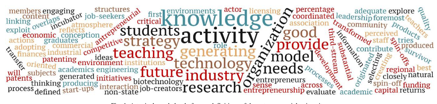
Fig. 1. A typical word cloud of some definitions of the entrepreneurial university

In the medium or long term, the competition in the global economy depends on technology-based strengths [7]. This includes the ability to apply new technology to reach new successful markets, as well as develop the skill level of the workforce to develop new products.