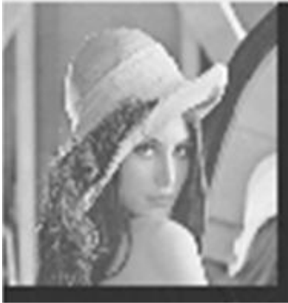
Fig.4. (b).Compressed Image