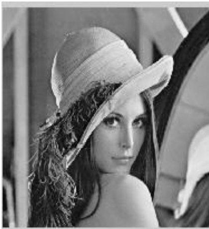
Fig.4. (c).Reconstructed Image

[2] W. Penne baker and J. Mitchell, JPEG Still Image Data Compression Standard. Van No strand Reinhold, 1994.