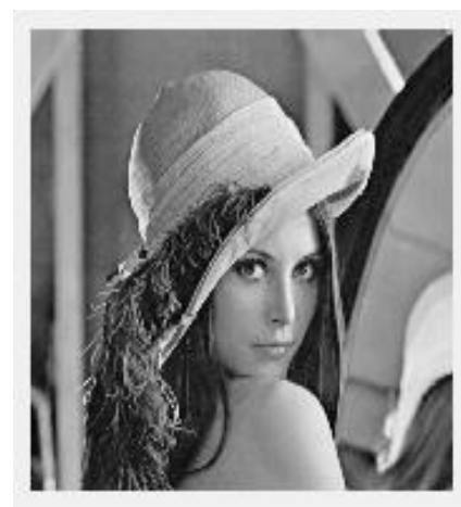
Fig.4. (a) Input Image

The performance DTT-SPIHT algorithm shows a high PSNR compared with DCT-SPIHT.