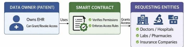
Fig. 3: Smart Contract Access Flow

E. Access Control Mechanism: Access to medical records is managed through public and private key cryptography. Only authorized users with valid credentials can access or modify the data, ensuring privacy and security.