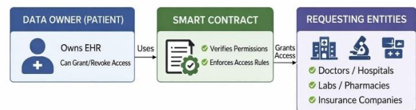
Fig. 3: Smart Contract Access Flow

E. Access Control Mechanism: Access to medical records is managed through public and private key cryptography. Only authorized users with valid credentials can access or modify the data, ensuring privacy and security.