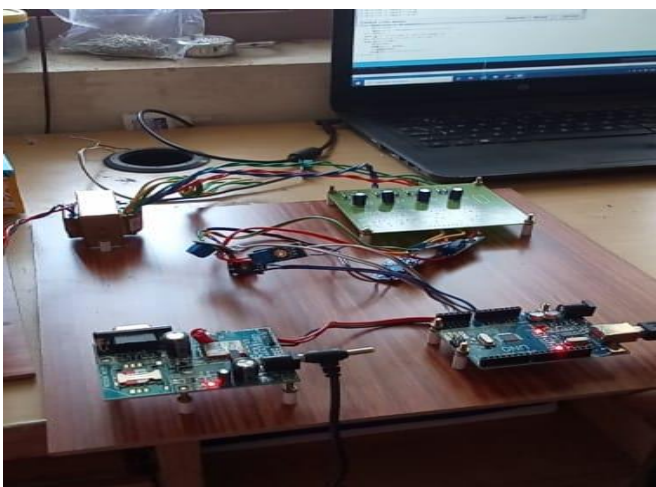
Fig: Hardware Set up