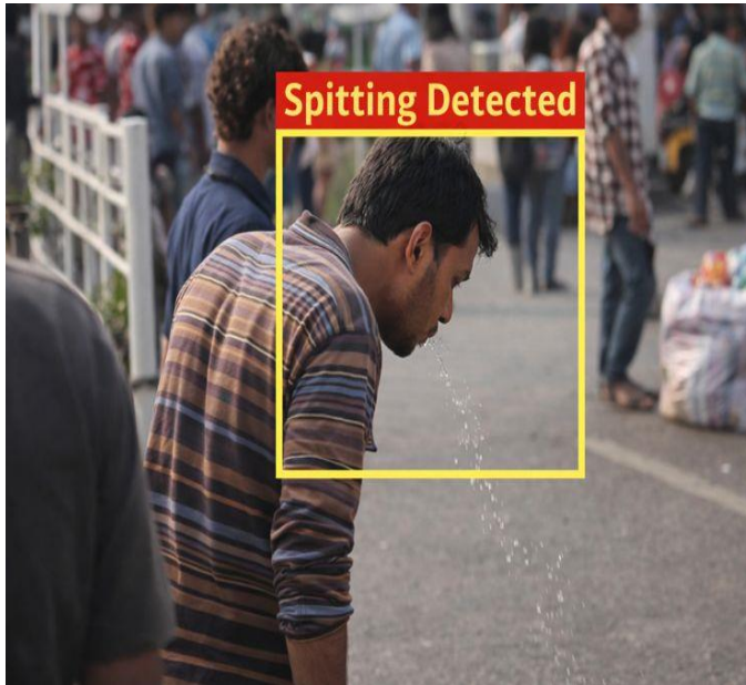
Fig. 3: Sample Output of Spitting Detection

Even though it started out shaky, the outcomes point toward solid performance when it comes to spotting issues and logging data. Because of what unfolded during evaluation, trust in its ability grows - especially around clearing up cluttered signals into readable formats. That kind of clarity might just guide smarter choices down the line.