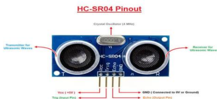
Figure 3.3(a): Image of Ultrasonic Sensor

Ultrasonic sensors are electronic devices that measure the distance to a target object by emitting ultrasonic sound waves (typically between 20KHz and several MHz) and converting the reflected sound into electrical signal. They are widely used for non contact, high reliability and precise detection of objects in various industrial, robotic, and consumer applications. These sensors are effective for obstacle avoidance and distance confirmation in disordered environments [6].