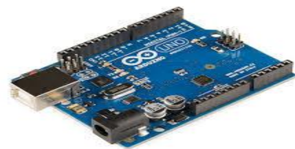
Figure 3.1(a): Image of Arduino Uno Microcontroller

The Arduino Uno is a popular, open source microcontroller based on the ATmega328P, serves as the central control unit. It works at 16 MHz crystal oscillator and provides 14 digital I/O pins(6PWM) and 6 analog inputs. It operates at 5V, powered by USB or a 7-12V source. Its simplicity, dependability, and compatibility with sensor modules make it suitable for embedded robotic applications, thus making it ideal for prototyping electronics[3].