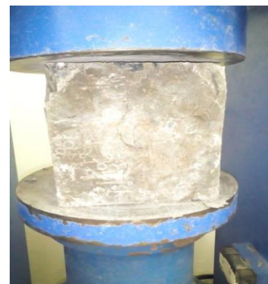
Figure 2 Compressive Strength Test for Concrete Cube in CTM