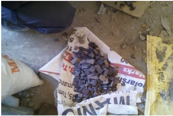
Figure 1 Weld Slag

The various material properties of the mix is presented in Table 1.