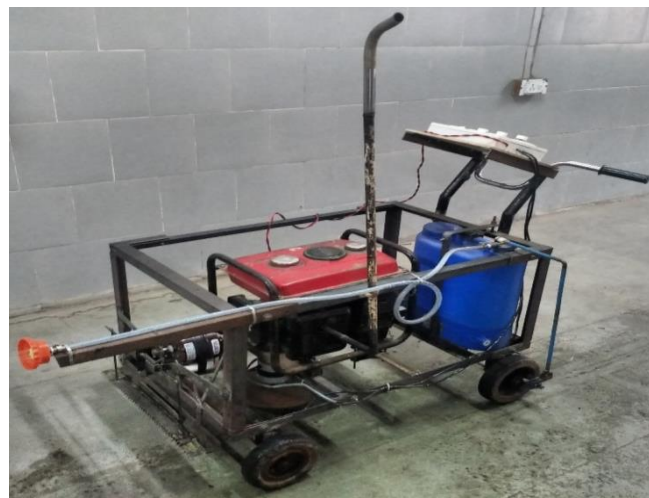
Fig. Multi-operational grass cutting machine