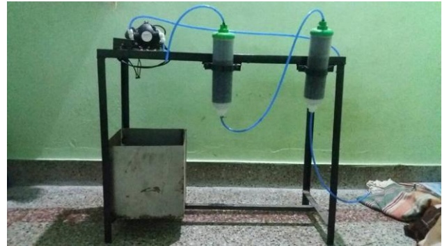
Figure 1. Treatment unit

If the test shows that your water does contain undesirable levels of iron and/or manganese you have two options: 1) obtain a different water supply; or 2) treat the water to remove the impurities. You might be able to drill a new well in a different location, or complete the existing well in a different water-bearing formation. Ask your well driller for advice on these options. If you decide to treat the water, there are several effective methods to choose from. These are summarized in Table 1. The most appropriate method depends on factors such as the concentration of iron and manganese in the water, whether bacteria are present, and the amount of water you need to treat.